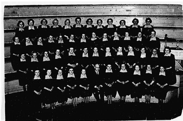
1927-1956, Fenton Ladies Choir, correspondence and papers, KC33/1/031, Kirklees (GB 204)